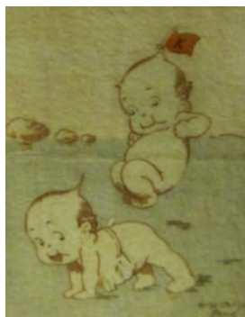
The Museum collection houses ten tobacco premium Kewpie Flannels, circa 1914. The flannel pictured (above) features Chief Wag jumping over Kewpie Cook. Flannels such as these would be used to make doll quilts for children.

that found their way into Kewpie adventures, including Dotty Darling and her sister Nan, but the most famous of all is Scootles, otherwise known as the Baby Tourist, who lived in Kewpieville and “scooted” about causing jolly mishaps. Many more Kewpie characters can be found in the delightful Kewpie Kutouts , a paper doll series, most all of which were intended to instruct children on how to be helpful or kind to others, or even more specific lessons. For example, Life Preserver Kewp taught water safety, whilst swimming about with the mermaid Kewpies, the Merkewps. If you look carefully, you can find a tiny Merkewp in our collection.