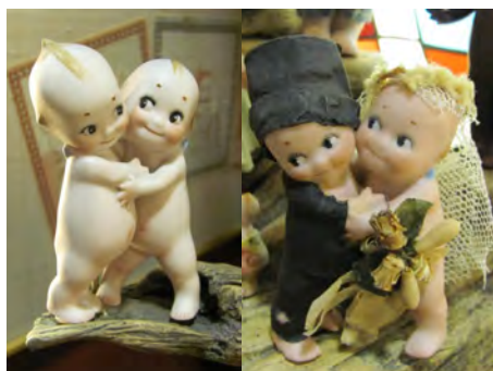
The Museum collection features many "Kewpie Huggers." The most popular "Huggers" were either not clothed (left), or dressed as a bride and groom (right). Both sets of Huggers are from Germany, circa 1910 and circa 1912, respectively.