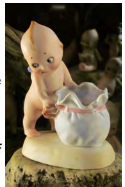
Kewpie with Candy Container Sack, circa 1915. Variations of this piece exist with brass plates on the base engraved with various expressions or terms of endearment.