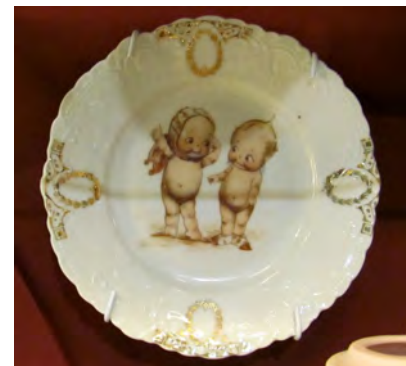
Collectible plate featuring Careful of His Voice Kewpie (left) and Always Wears His Overshoes Kewpie (right). The Museum has two matching plates. Germany, circa 1915.

By all accounts, Rose O'Neill was a wonderful woman. Stories of her compassion and generosity are abundant, giving a backbone of truth to her imaginary Kewpies and their lifestyle of