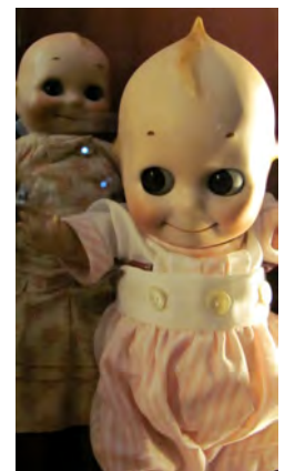
This rare 12" original Kestner model of a Kewpie has a bisque socket-head with large, brown glass eyes and wooden ball-jointed toddler body. Germany, circa 1912.