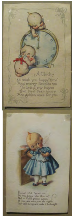
The Museum houses a display of five early 20th Century Kewpie postcards, including the two pictured (above). Postcards featuring Kewpie designs were extremely popular, released by companies such as Campbell Cards and Edward Gross Co.

The name “Kewpie” is a word derived from Cupid. Kewpies are similar to Cupid, with their plump, infantile bodies and little wings, but their similarities end there. Cupid is armed with bow and arrow to pierce the heart with love, but Kewpies exist only to be merry and helpful. O’Neill put it quite simply, noting that “Cupid gets you into trouble and the Kewpies get you out.” O’Neill fashioned a world just for her Kewpies, which she appropriately dubbed Kewpieville. The residents of this town include Chief Wag, the town leader, always shown wearing a flag with a ‘K’ protruding from his topknot; the Kewpie Gardener, who not only planted flowers but also kept the town clean, shown holding rakes or hoes and wearing a wide-brimmed straw hat; Kewpie Carpenter, the town’s handyman, always wearing his tool belt and brandishing his trusty hammer; and Kewpie Cook, with his little apron, whose duty was to keep tummies full. Over time, more Kewpies came about, including Blunderboo, always clumsy and falling over, the Kewpie Lovers (Katy O’Kewp and Johnny McKewp), Katy’s grumpy Uncle Hobgoblin (who regularly kept Katy in jail to keep her away from Johnny), and Kewpidoodle Dog. Some Kewpies had elaborate names, such as Careful of His Complexion, who appears in a sunbonnet, Careful of His Voice, who wears headscarves, and Always Wears His Overshoes who, unsurprisingly, always has shoes on. There were humans