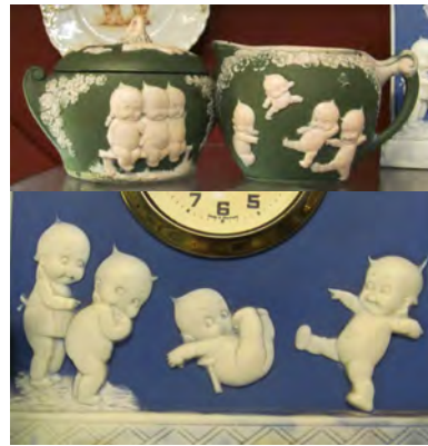
Green Jasperware Kewpie Sugar and Creamer set (above) and Blue Jasperware Clock (detail, below). Bisque, Germany, circa 1910. Both pieces show the popular Kewpies from Kewpieville: Kewpie Cook (shown in his apron), Kewpie Carpenter (with his tool belt and hammer), and the Always Wears his Overshoes Kewpie who seems about to fall over in both scenes.