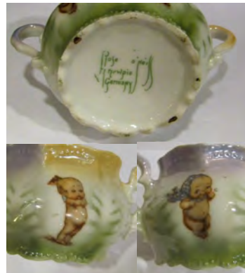
Porcelain Kewpie Sugar Bowl. Germany, circa 1912. The exterior features images of Chief Wag (left) and Careful of His Voice (right).

Below, extremely rare Kewpie Riding a Mountain Goat. Germany, circa 1912.